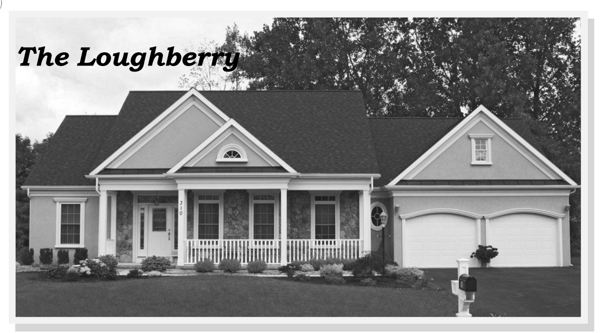
Included Features: Front Porch, Stone/Vinyl façade, with Vinyl Sides and Rear